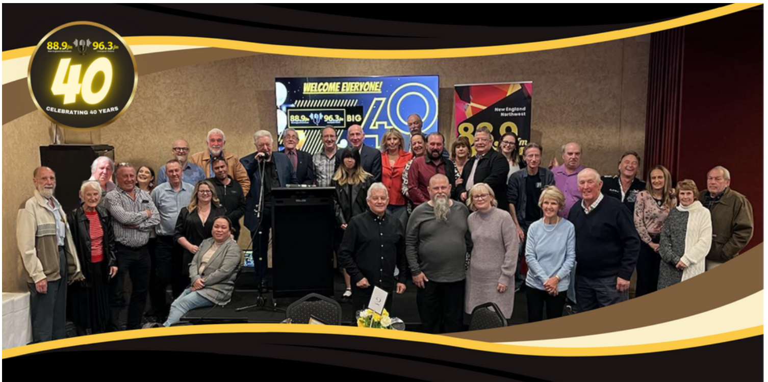
The 88.9fm and 96.3fm 40th Birthday Celebration