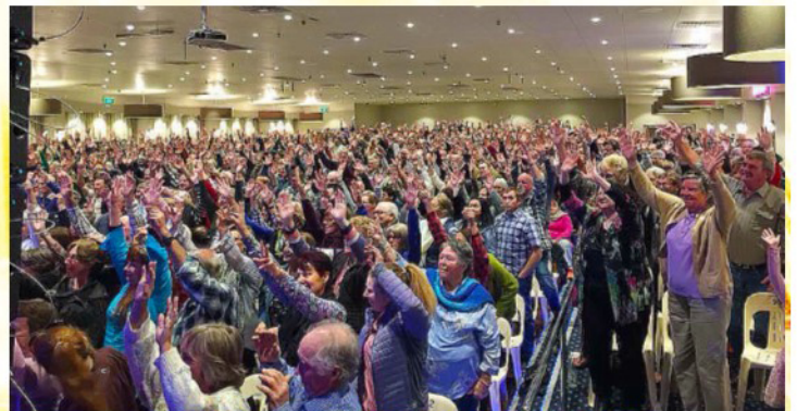
*The sold out crowd in Wests' Blazes Showroom