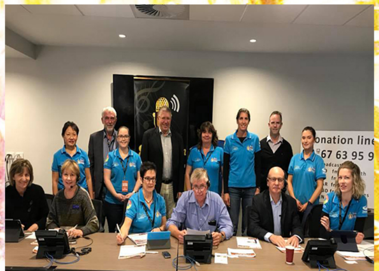
The team manning the phones for the RU Aware radiothon before the We Care Concert kicked off in July.